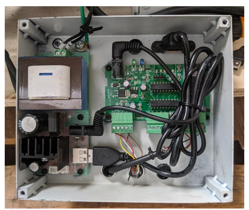
Power and USB cables replaced, ready to reattach.

10. Reassemble everything by reversing steps 5 through 1.