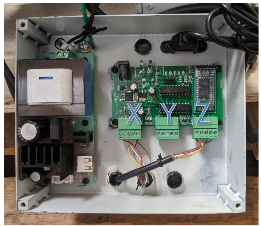
Connect the carriage scale to Z and the cross slide scale to X.

9. Plug the unused connector block from step 6 into the Y-axis connector.